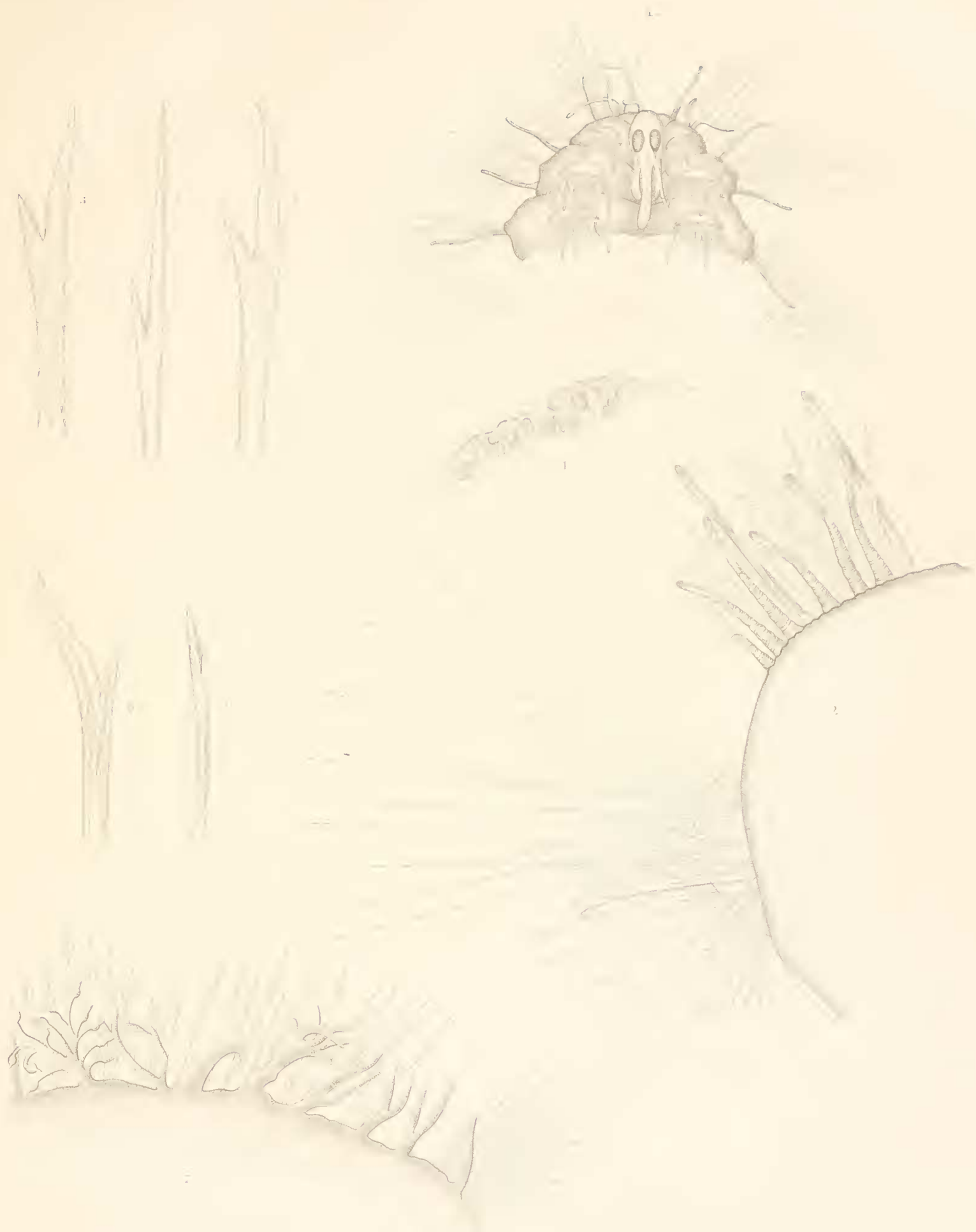
Fig. 7—9 Ch. F. H. Dumont, cet. C. Ritsema del.